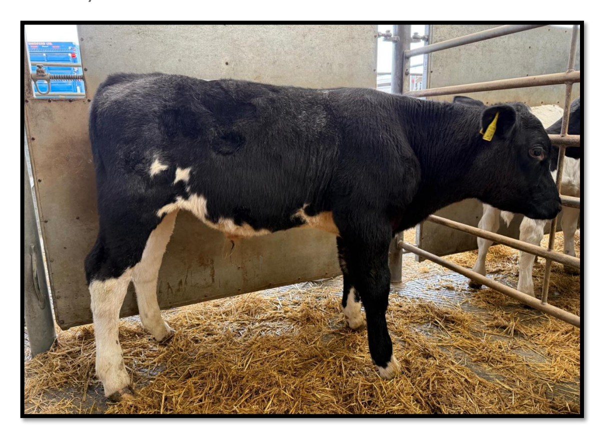
British Blue Bull Calf to £800