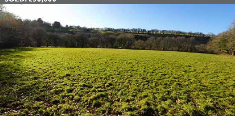
Approximately 3.49 acres of pasture land in a single gently sloping enclosure with parish road frontage.

Tavistock | Auction Guide Price £45,000 - £50,000 SOLD: £50,000