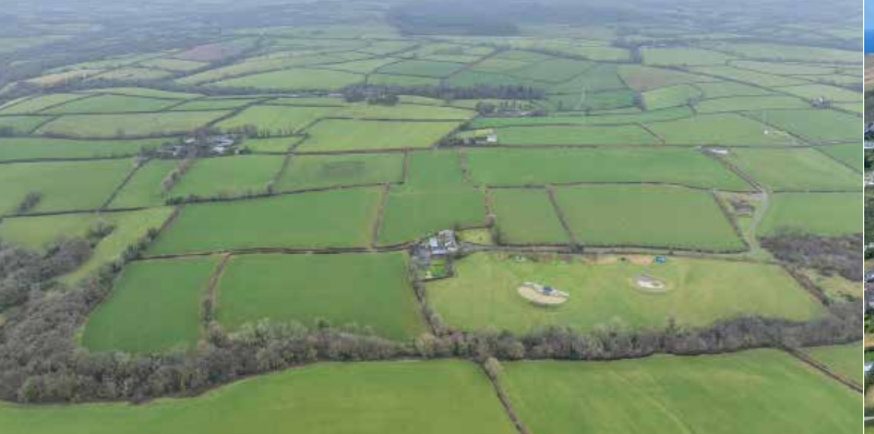
Land at Polzeath

Ashwater, Beaworthy | Guide Price £620,000